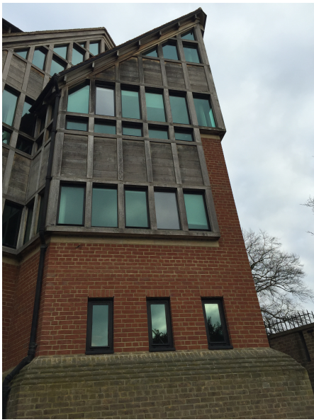
The College where Newton had his studies.