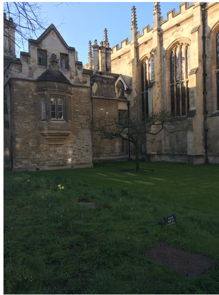
The three (naturally not the real one) where Newton understood the law of gravity.