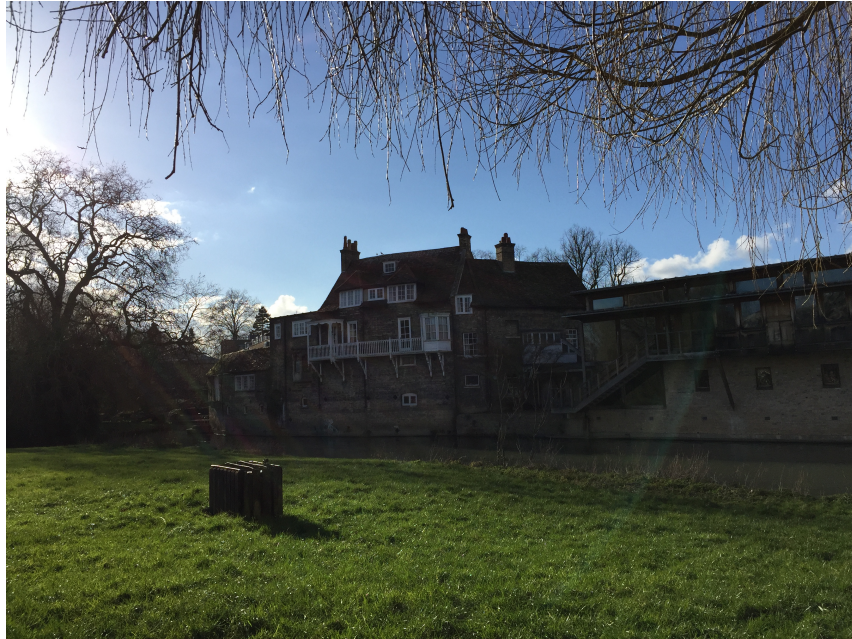
In this ex College, Darwin had his studies.