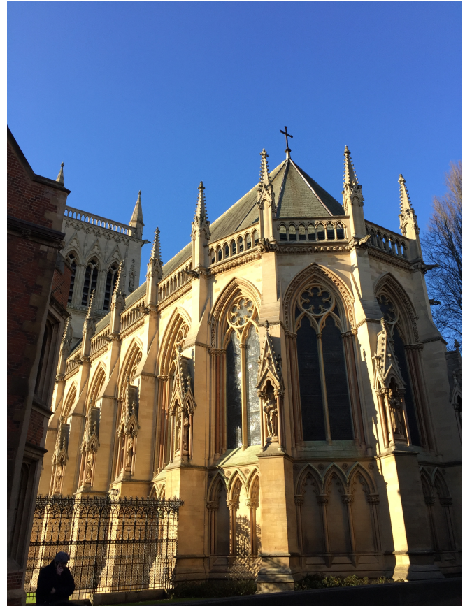
St. John's Chapel.

We were accommodated in different families, and it was the best way to learn more English, and what they usually do. The only thing missed was the Italian food, for the rest the family where i spent that week was friendly and really kind.