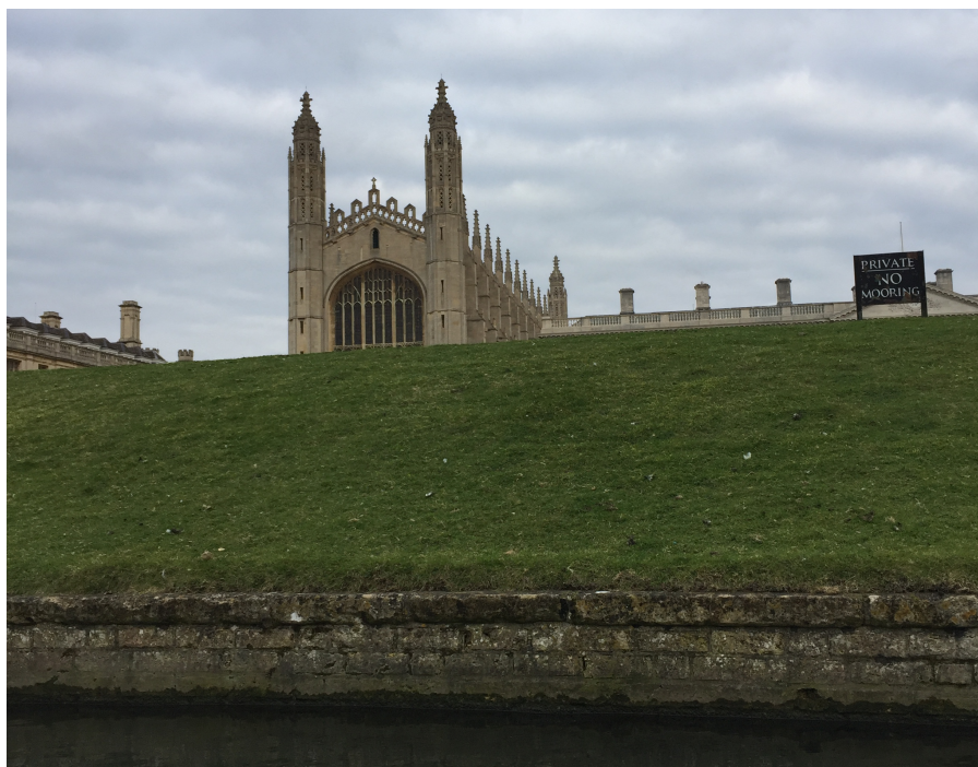
A photo of the famous Chapel of Kings College

On the 22rd of February, we went to Cambridge for a week, for a Cultural and Linguistic trip. Cambridge is a lovely city, not too far from the Capital of England (London) and it leads you into a peaceful and cultural environment.