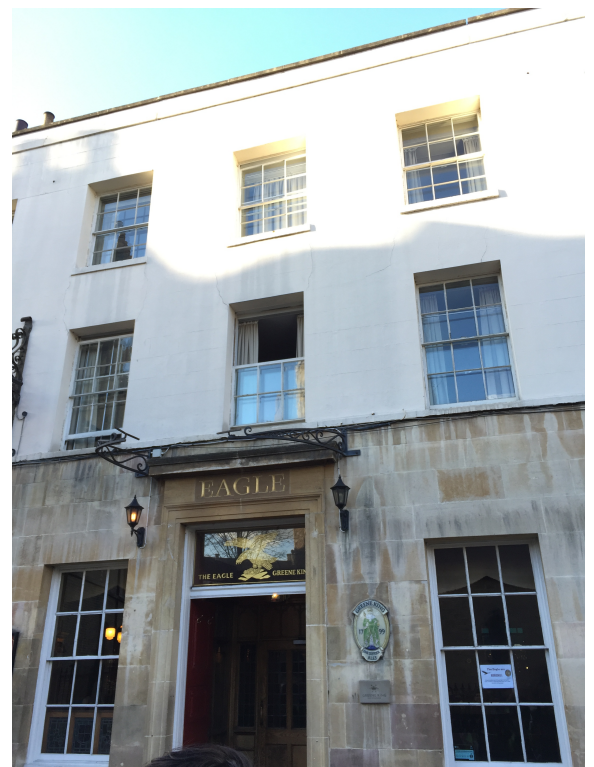
In this Pub, the oldest of Cambridge, DNA was discovered.

In the morning we had lesson at the Kaplan International English school. We had three lessons: the first one was one hour and forty-five long and then we had ten minutes break. The second one, was one hour and half long, and after lunch we had the last lesson of the day, that lasted only one hour.