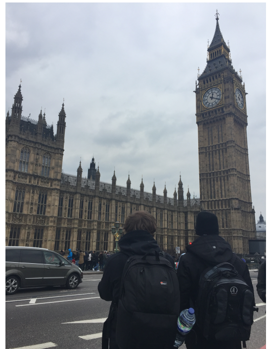
The famous Big Ben.

I hope that i can repeat it next year, and i have to say thanks to my school, for giving me this opportunity.